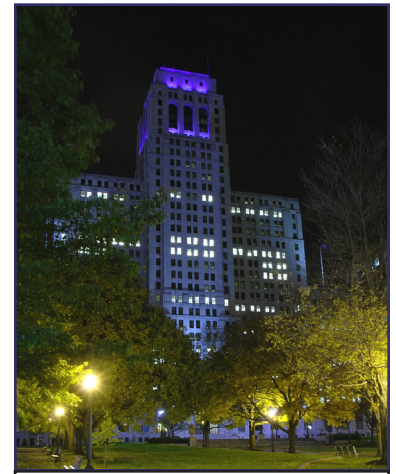
The Alfred E. Smith Building in Albany was illuminated purple in October for Domestic Violence Awareness Month. Visit www.opdv.state.ny.us/public_awareness/shine_the_light.html to see more photos. Think about how you can join us in October 2009!

The Office of Court Administration estimates that, since going into effect, the new law has resulted in 2,200 applications for "intimate relationship-type" orders of protection in the state's Family Courts. [NY Law Journal 11/19/08]